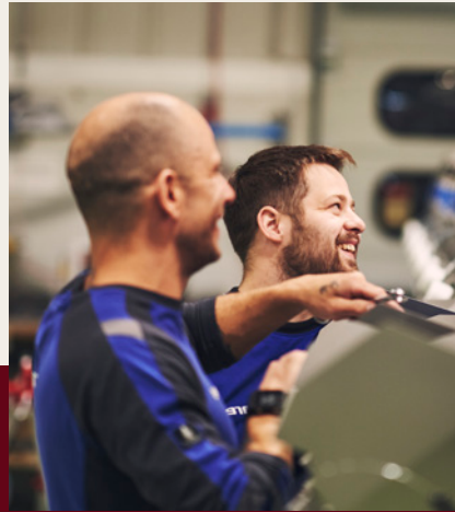
Create with Collaboration