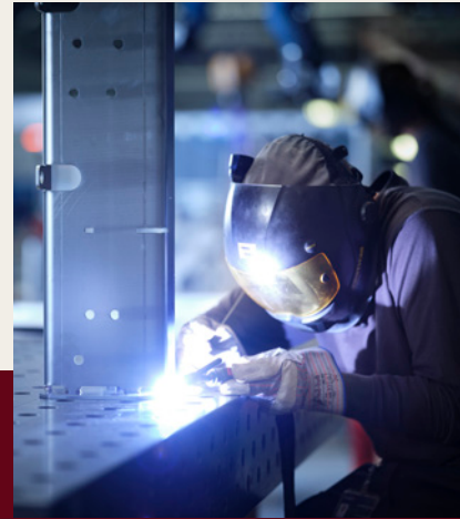
Grow with Excellence