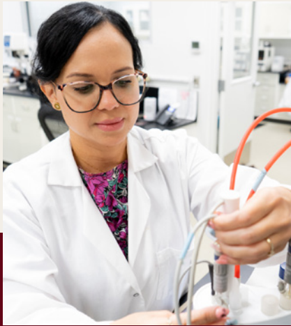
Serve with Integrity